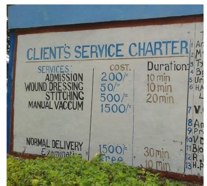
A notice outside a rural health clinic

The church in Africa has much to teach us in the West. Generous hospitality, sacrificial service, prayerfulness and a willingness to celebrate are all things we need more of here.