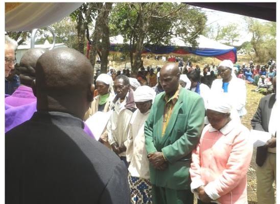
An outdoor baptism service

The church is providing a focal point in bringing together poor rural communities for celebration, support and action. When life is tough, celebration becomes all the more important, and the church is at the heart of that, providing food, hosting community choirs, marking rites of passage. Countless times during the week's visit, Tulo sat down to eat with communities. The food was simple; but the hospitality remarkable in its generosity.