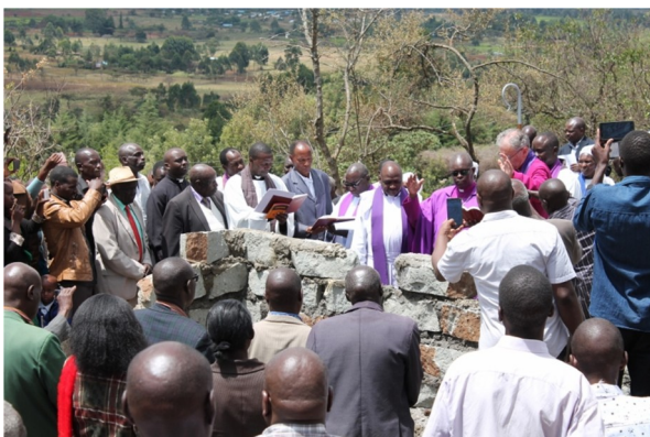
Blessing the foundations of a new church